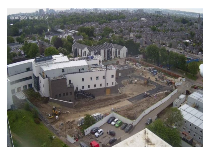
The ANCHOR Centre west elevation – view of the ongoing road formation, landscaping and groundworks.

The fencing, landscaping and planting are progressing well and the access road and pavement formation is underway.