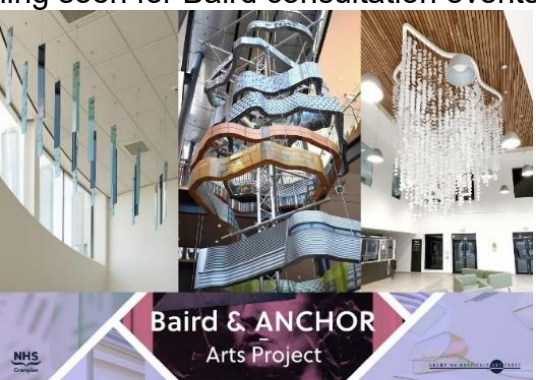
Meet the Artists

We held our last ANCHOR art consultation event on 1st of July. Look out for dates coming soon for Baird consultation events.