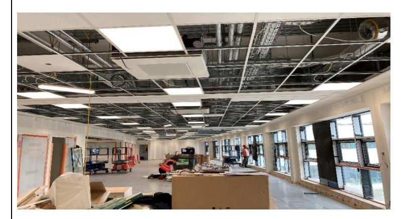
The ANCHOR Centre First Floor - open plan office

The ANCHOR Centre first floor large open plan office for NHS Grampian staff is complete and ready for the ceiling installation and carpet tiles to be laid on top of the raised access steel floor tile system which provides an under floor route for electrical / data cables to floor pods (socket outlets). This ensures minimal disruption to office functions and much more flexibility compared to routing services through ceiling voids and having to install power columns.