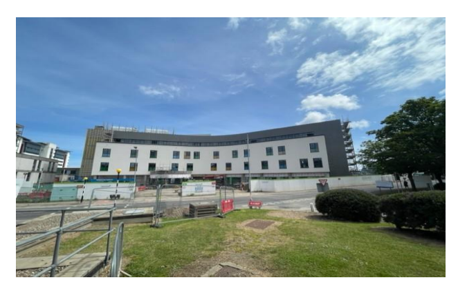
Baird west elevation (main entrance) facing Foresterhill Road – almost complete

The Baird Family Hospital external envelope rendering and cladding is progressing well and has been boosted by the recent spell of good dry weather.