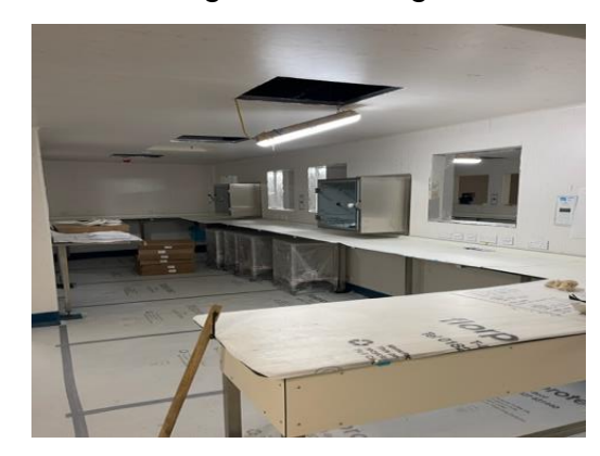
The ANCHOR Centre – Lower Ground Floor Aseptic Pharmacy Suite Outer Support Room

The Aseptic Pharmacy Suite is predominantly complete with the installation of final fixtures and equipment installed leaving only minor snagging prior to commissioning and cleaning.