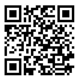
If you have a question, scan here!