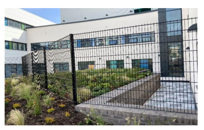
The ANCHOR Centre – west elevation landscaped courtyard adjoining Radiotherapy

The ANCHOR Centre internal fit out is nearing completion. The lower ground floor is at the most advanced stage and is currently in the process of being inspected by GRAHAM supervisors to identify snags and outstanding work in preparation for final inspection by the NHS Grampian Technical Team who will ensure the building is free from defects, is fully functional and operational. Part of the ground floor is at a similar stage and the first floor is not far behind.