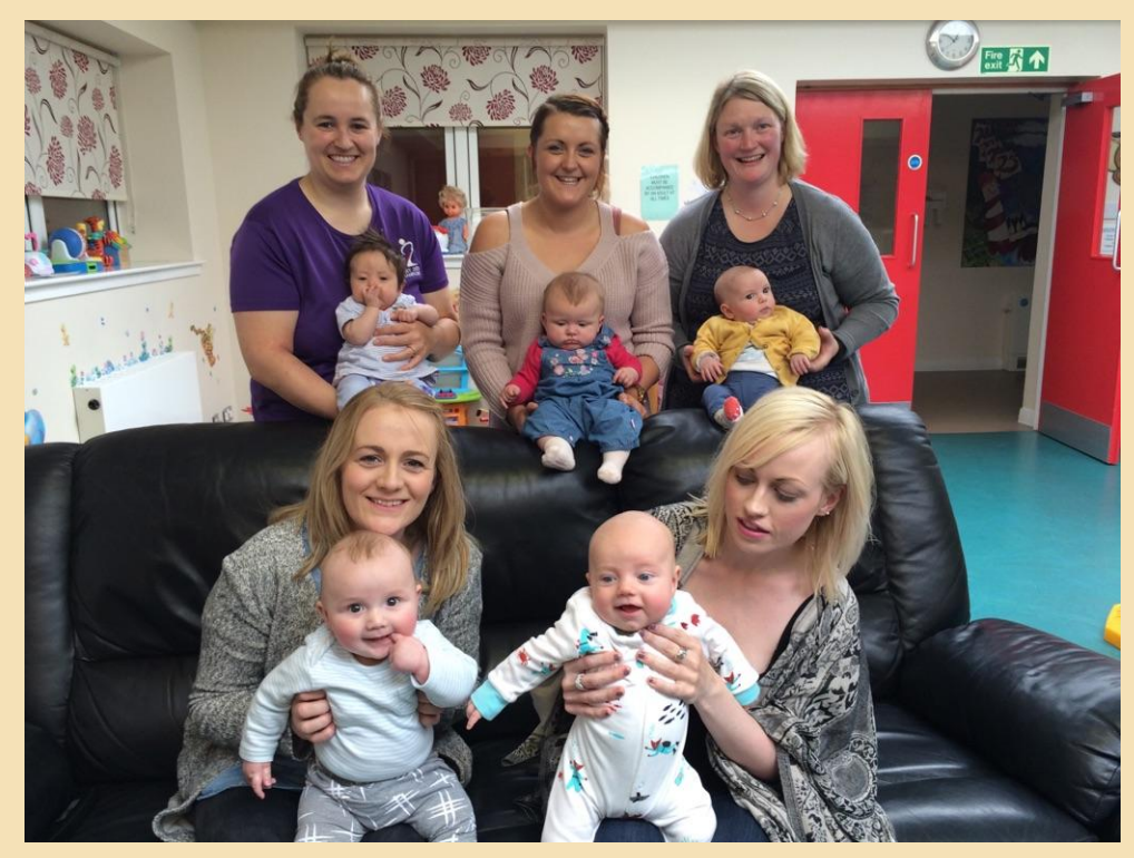
Orcadian babies and their mums giving their views on The Baird Family Hospital plans

Feedback from both visits will contribute towards the final designs for both buildings as well as the service redesign agenda. The project team is grateful to everyone for their contributions.